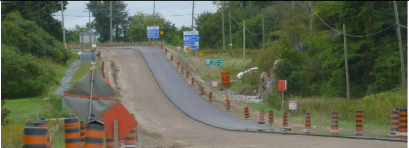
Yes indeed, that is new pavement rolling on Highway 15 in the Bay area...glory be!