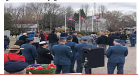
November 11th.. "We SHALL Remember."

See the "Calendar of Events" on the back page or the Legion's Facebook page for more details!