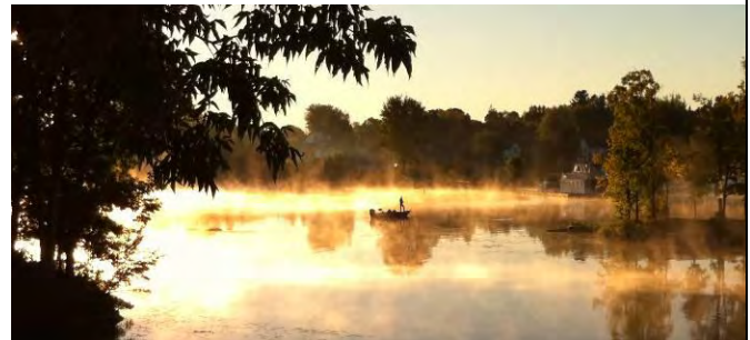
Perfect morning - S. Sisson