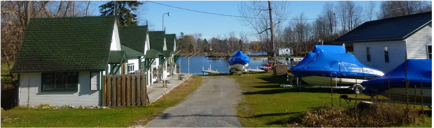
Homes and businesses are battering down for winter....

...check out our visitor info at www.visitseeleysbay.ca & events calendar and local resources at www.seeleysbay.ca