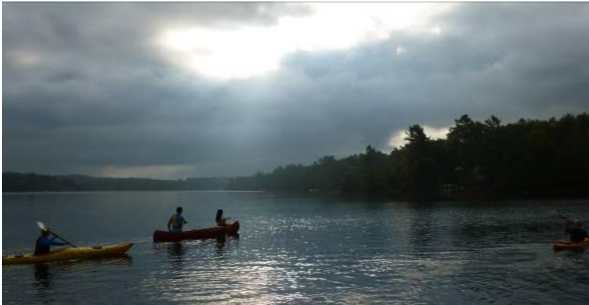
On Aug 12 at a professional 'photo shoot' on Whitefish Lake for some Seeley's Bay marketing images, the light was magical

...and check out events calendar and local resources at www.seeleysbay.ca